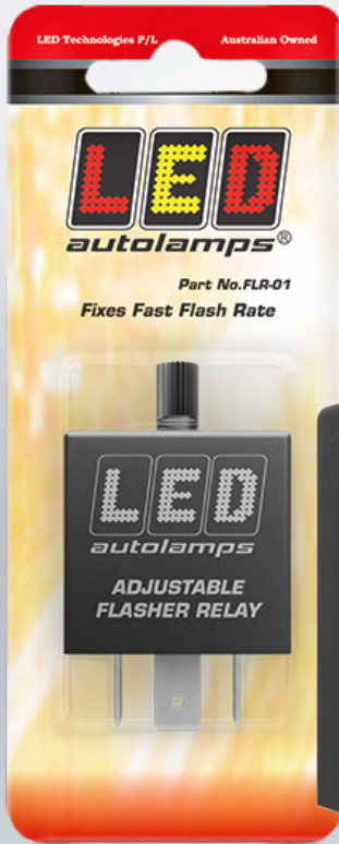
Part No. FLR-01