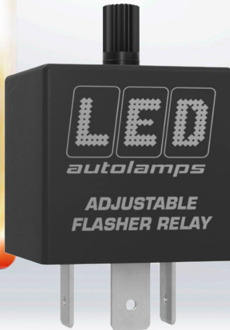
Part No. FLASHER1